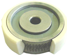
Old Carrier Wheel