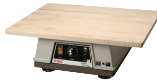
Syntron Jogger US - 7799.1709 Syntron Jogger European - 7799.2543.4