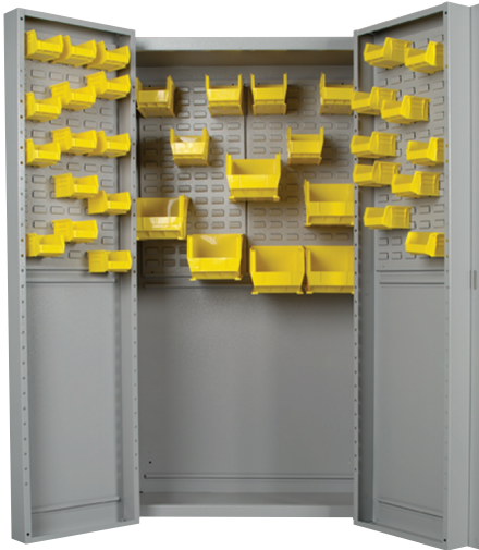
Spare Parts Cabinet with Bins - 7799.1982