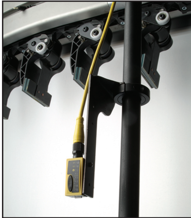
Laser Hanger Detector - 7703.8229.1

This detector improves the accuracy of detection and allows placement of the detector at the exiting point of the inserter.