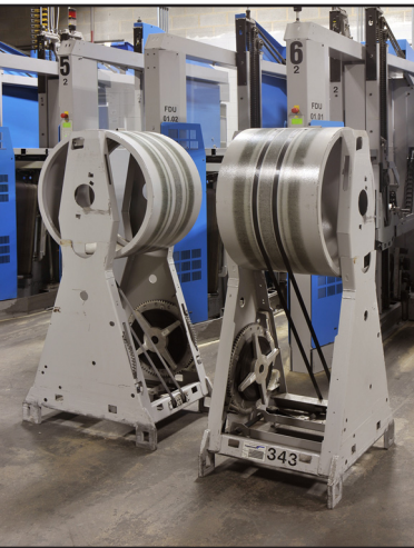
FlexiRoll Stands - 7540.600

We have new and used FlexiRoll stands in stock. Each roll stand can store approximately 130,000 broadsheet pages with a maximum product size of 15 3/4" x 11/38".